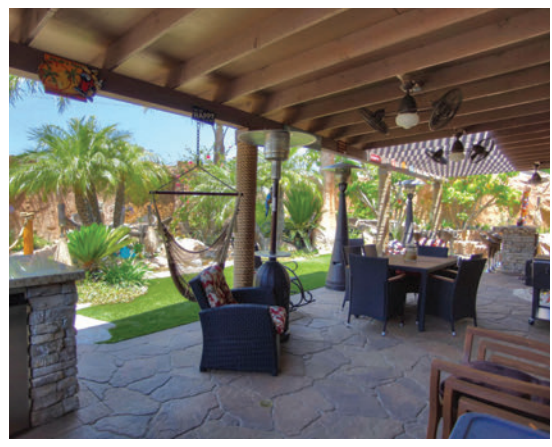
Outdoor dining arear