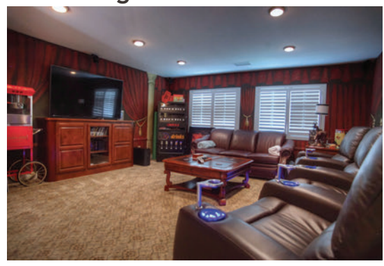
Loft - theatre room