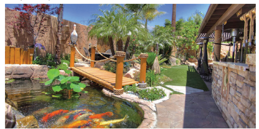
Above: Koi pond and tropical style back yard