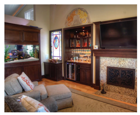
Family room with fire place