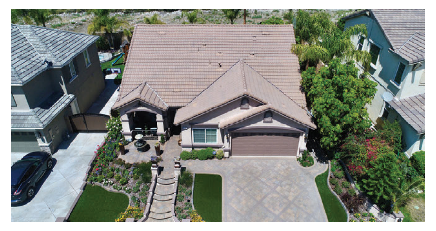
Above: Sky view of home