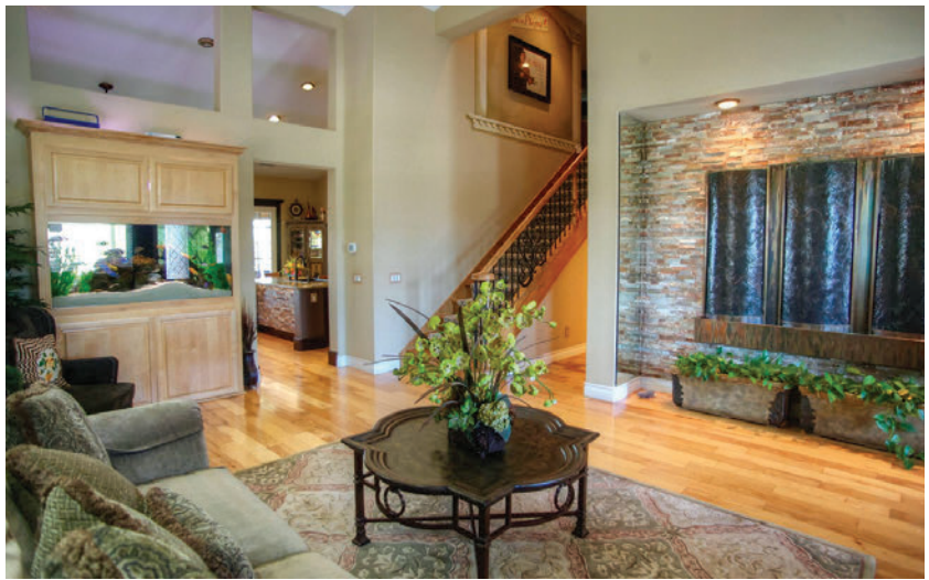
Above: Formal livingroom Below: Kitchen with island, granite counter tops