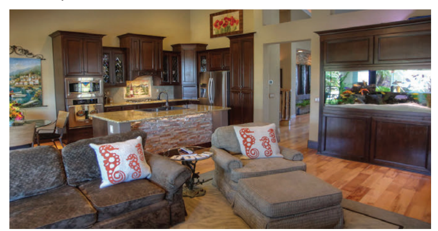
Family room adjacent to kitchen